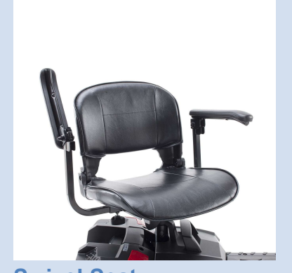
Swivel Seat 360° swivel seat with flip-up armrest makes it easier to get on or off the scooter