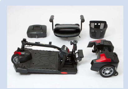
Portable Disassembles easily for transport