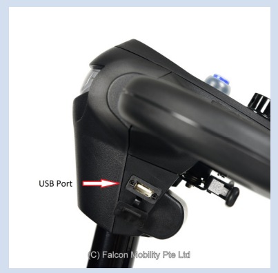
USB Port USB Port for charging mobile phones on-the-go